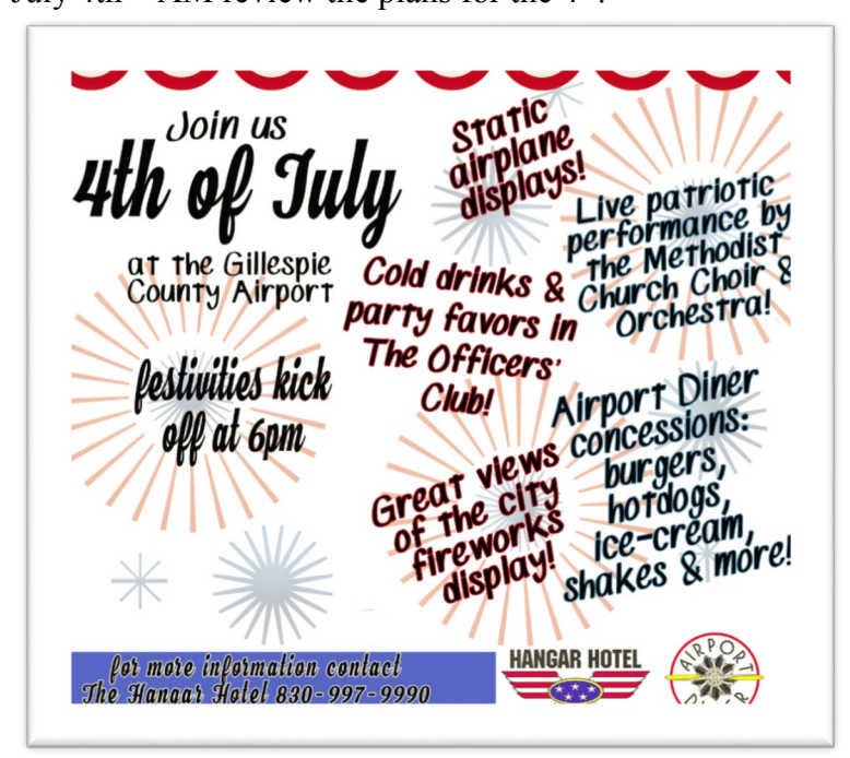
Sept 12-15 – Single Engine Commander Fly-in Sept 25-29 – King Air Fly-in

• Upcoming Events – July 4th – AM review the plans for the 4<sup>th</sup>.